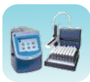
Total Organic Carbon 3800